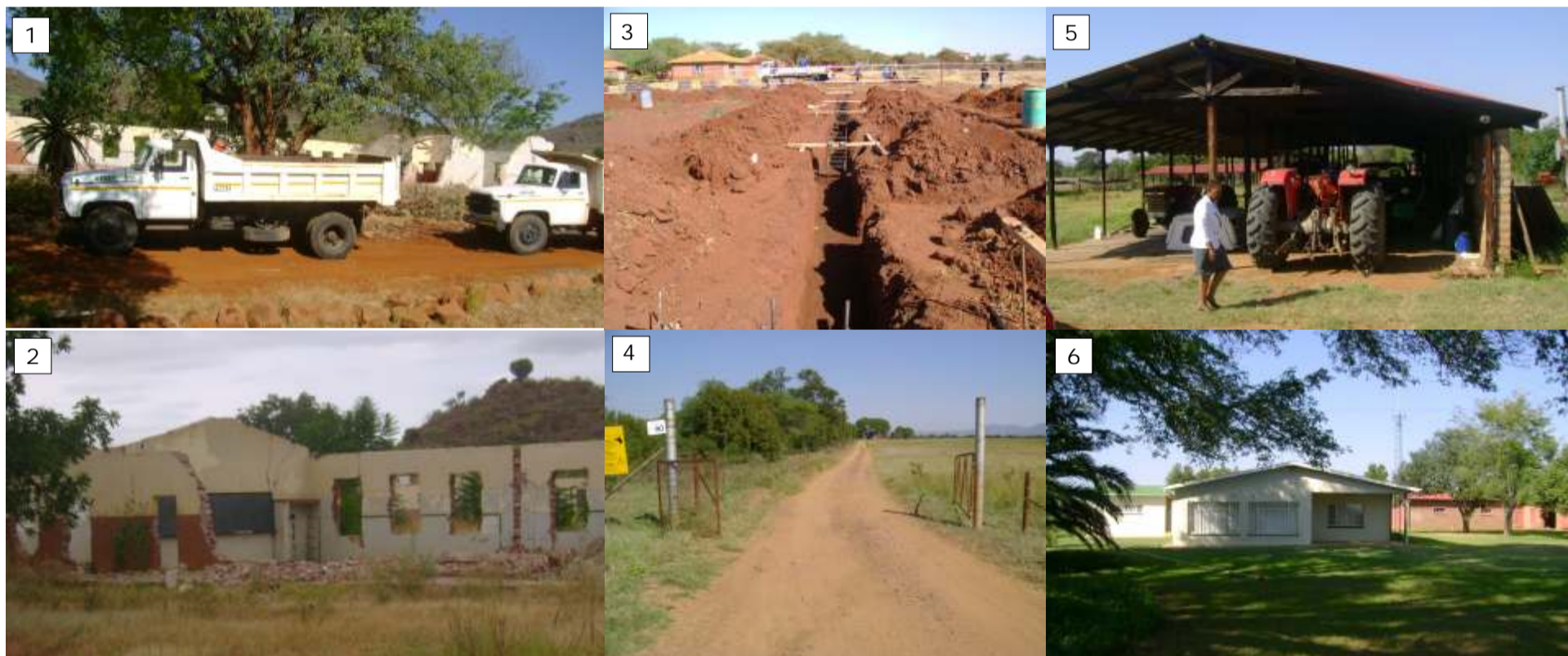
1. Tip trucks arrive at the Business Studies Centre in Mahwelereng. 2. Buildings must be demolished to make place for the Simulation Centre. 3. Construction people busy at the Engineering and Skills Training Centre with the Mechanical Workshop. 4/5/6. The farm at Sterkrivier that was bought by Waterberg FET College. Agriculture learners will do their practical work there.