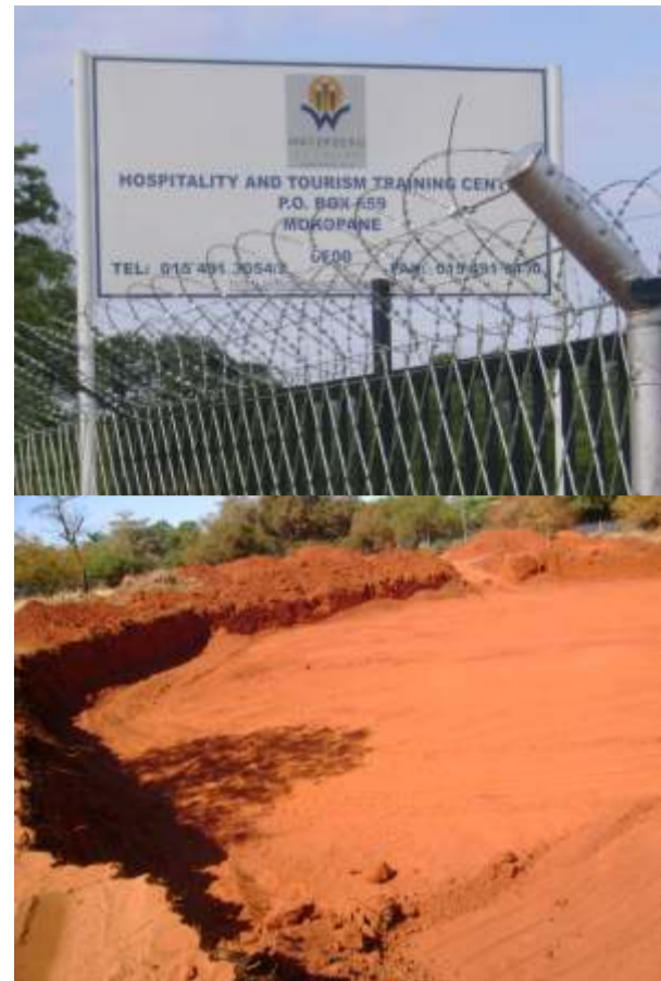
Construction started in Mokopane on the building of a Hotel and Tourism Centre for Waterberg FET College.

At Lebowakgomo, the new Motor Mechanical Workshop will be used for all engineering related courses.