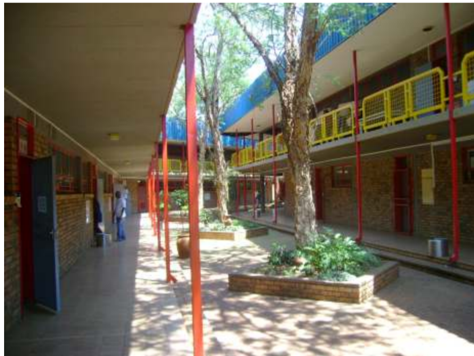
Block F of the It and Computer Science Centre that are occupied by Waterberg FET College and i-Community